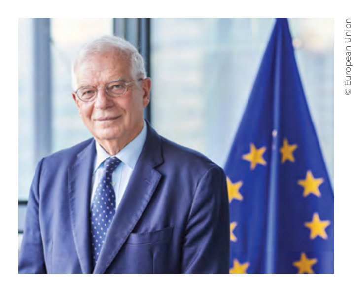
Foreword by HR/VP Josep Borrell

In 2019, when I presented my views on my future mandate before the European Parliament, I said that Europe needed to learn the "language of power". From the start, I was deeply convinced that the defence and security part of my job as High Representative would become crucial. And that conviction was behind the decision to elaborate a "Strategic Compass", a new EU security and defence strategy to advance towards a common forward-looking strategic culture as well as to give us a 'guide for action' with concrete deliverables and timelines.